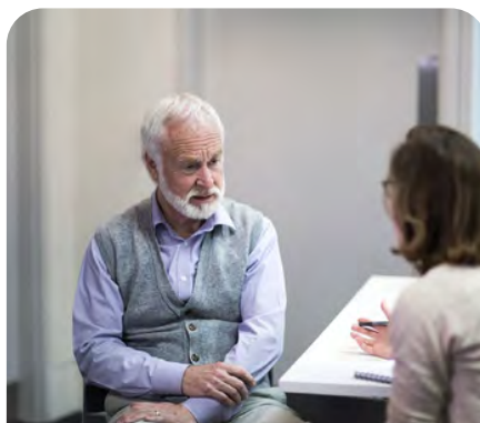
Primary Care Toolkit

ELDAC Toolkits provide a pathway for users to access meaningful and