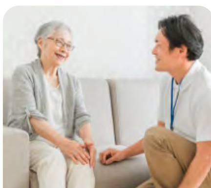
Allied Health Toolkit