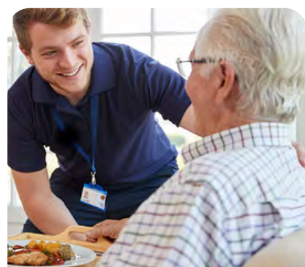
Managing Risk Toolkit