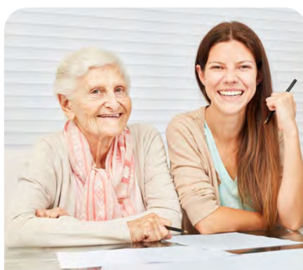
End of Life Law Toolkit