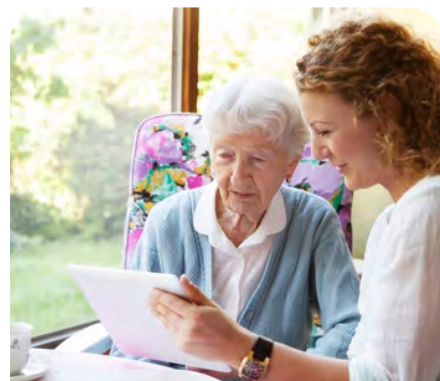
Home Care Toolkit