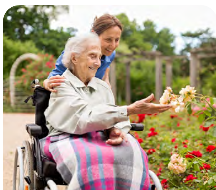
Residential Aged Care Toolkit