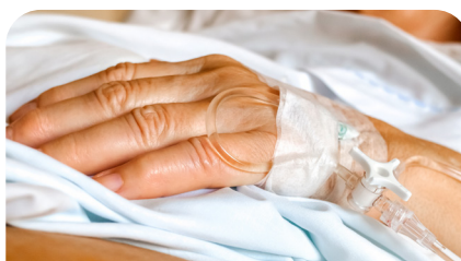
Voluntary Assisted Dying