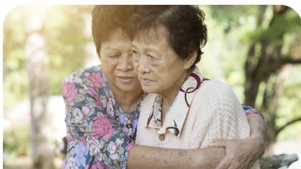
Futile or Non-Beneficial Treatment