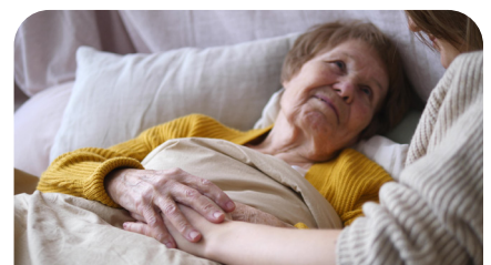
Withholding and Withdrawing Treatment

The ELDAC End of Life Law Toolkit contains free printable fact sheets, case studies, and mythbusters. As the law is different in each State and Territory, the toolkit connects you to trustworthy information relevant to your place of work.