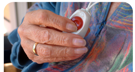
Emergency Medical Treatment